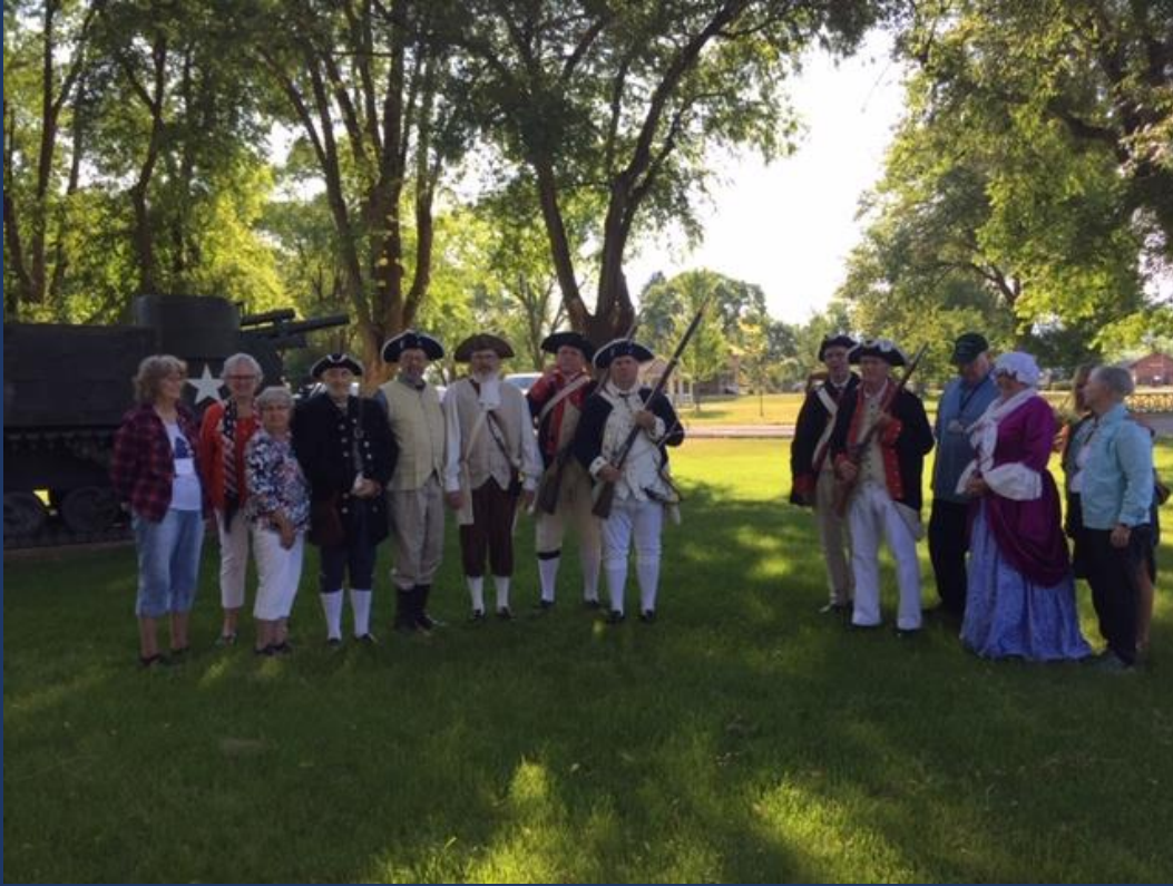
Group picture of the Liberty Tree and DAR members in attendance at Fort Missoula for the 4 th Encampment.