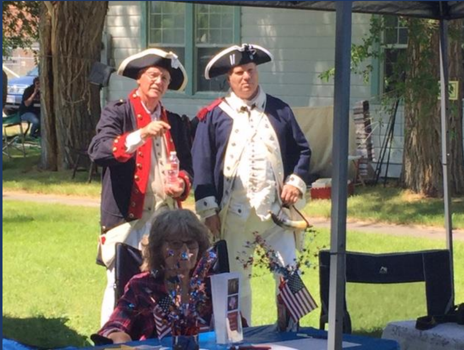
Don and Don discuss the influx of people coming to the Liberty Tree Encampment.