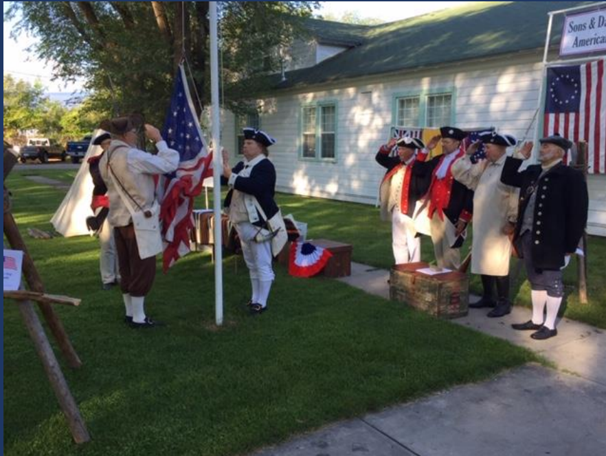
Compatriots of the Liberty Tree Chapter stand at attention as the American Flag is raised to start the July 4 th Celebration.