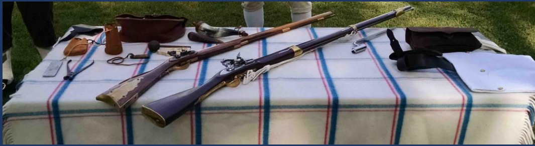
Revolutionary War Replica weapons and the necessary equipment for a Colonial Soldier on display.